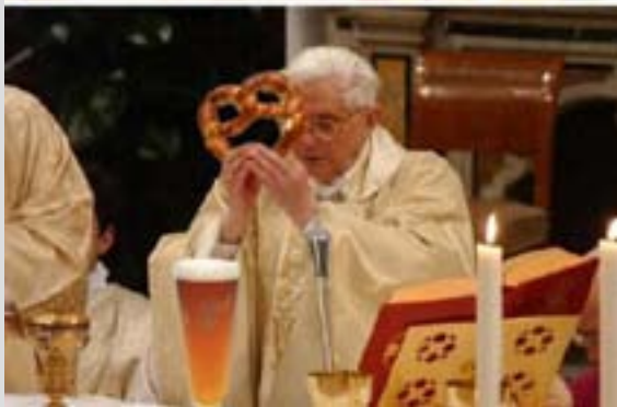
Recently, the new German Pope made some important changes to the liturgy