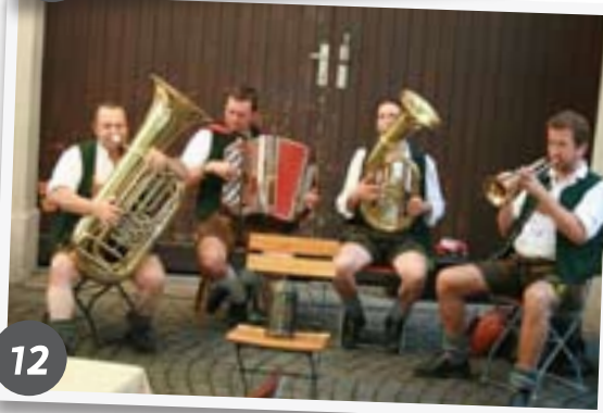
6. Munich Oktoberfest grounds; 7. Kettles at the Hacker-Pschorr Brewhaus; 8-9. Signs marking Stammtisch tables; 10-13. Munich Hofbrau Haus