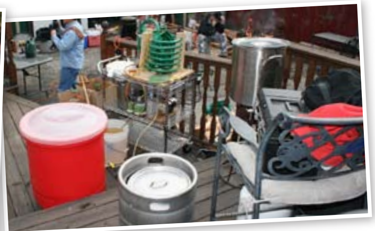
Dave Harsh's setup in the midst of 10 gallons of 1.100 doppelbock