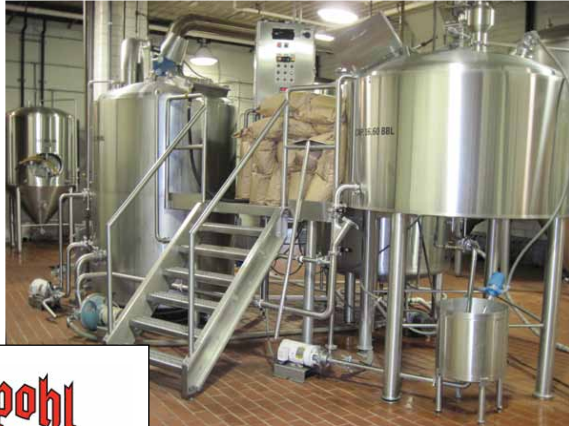
Bags of pre-milled grain piled on the platform ready to be mashed