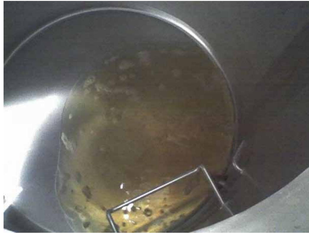
(L) The grant