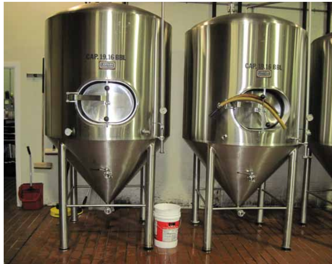
(R) Fermenter #1 cleaned and ready for the Hudy Bock