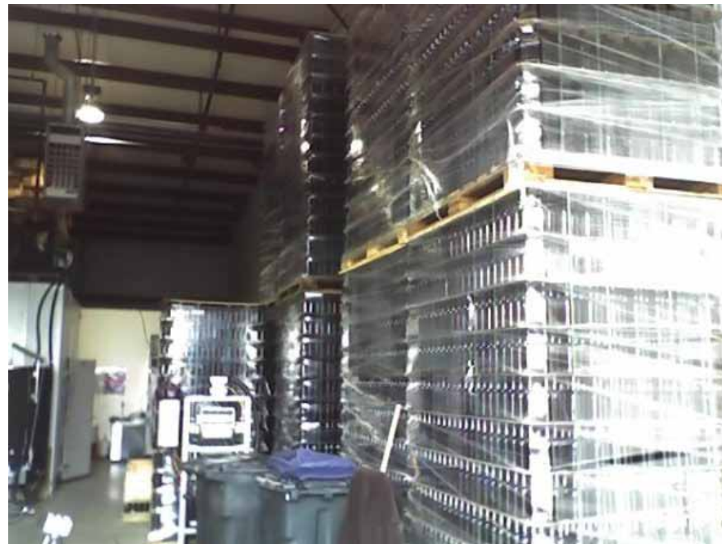
(L) Fermenter just waiting for the first batch.