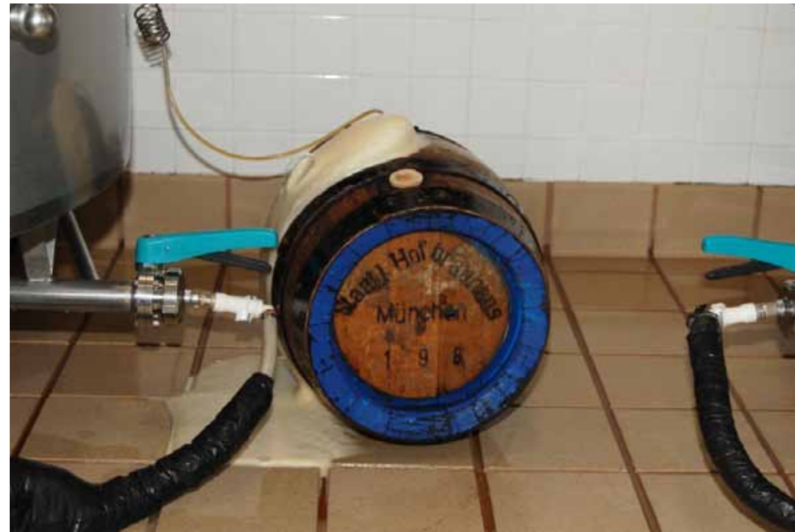
Filling the ceremonial keg from the serving tank in the brewery