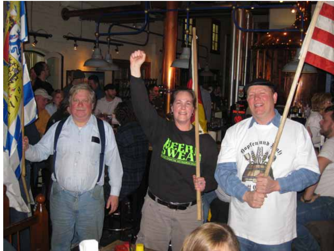
Bloats leading the parade of flags