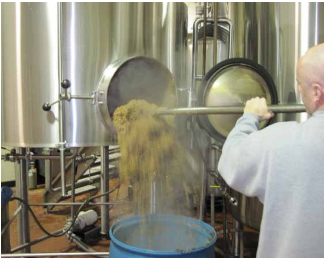
(L) Cleaning out the lauter tun