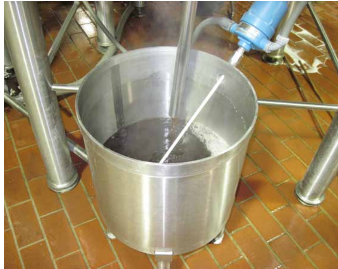
(R) Collecting the wort in the grant