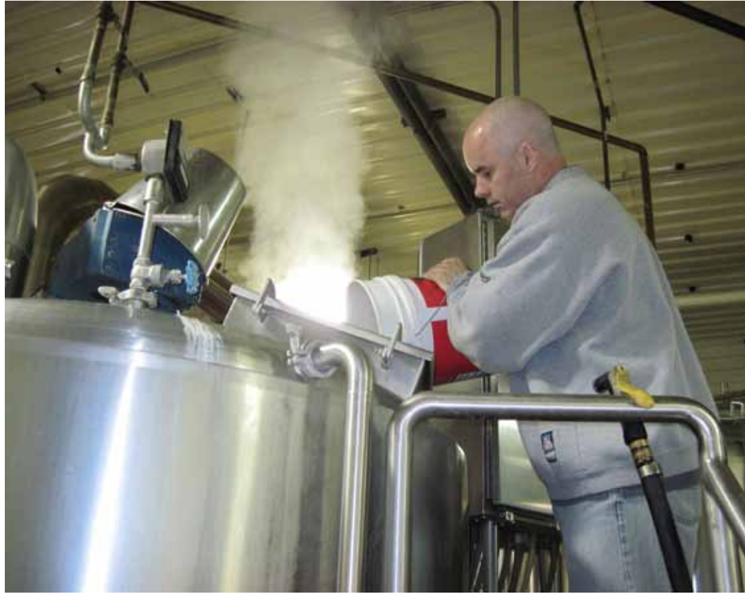
(L) Adding the 7lbs of hops at 60 minutes