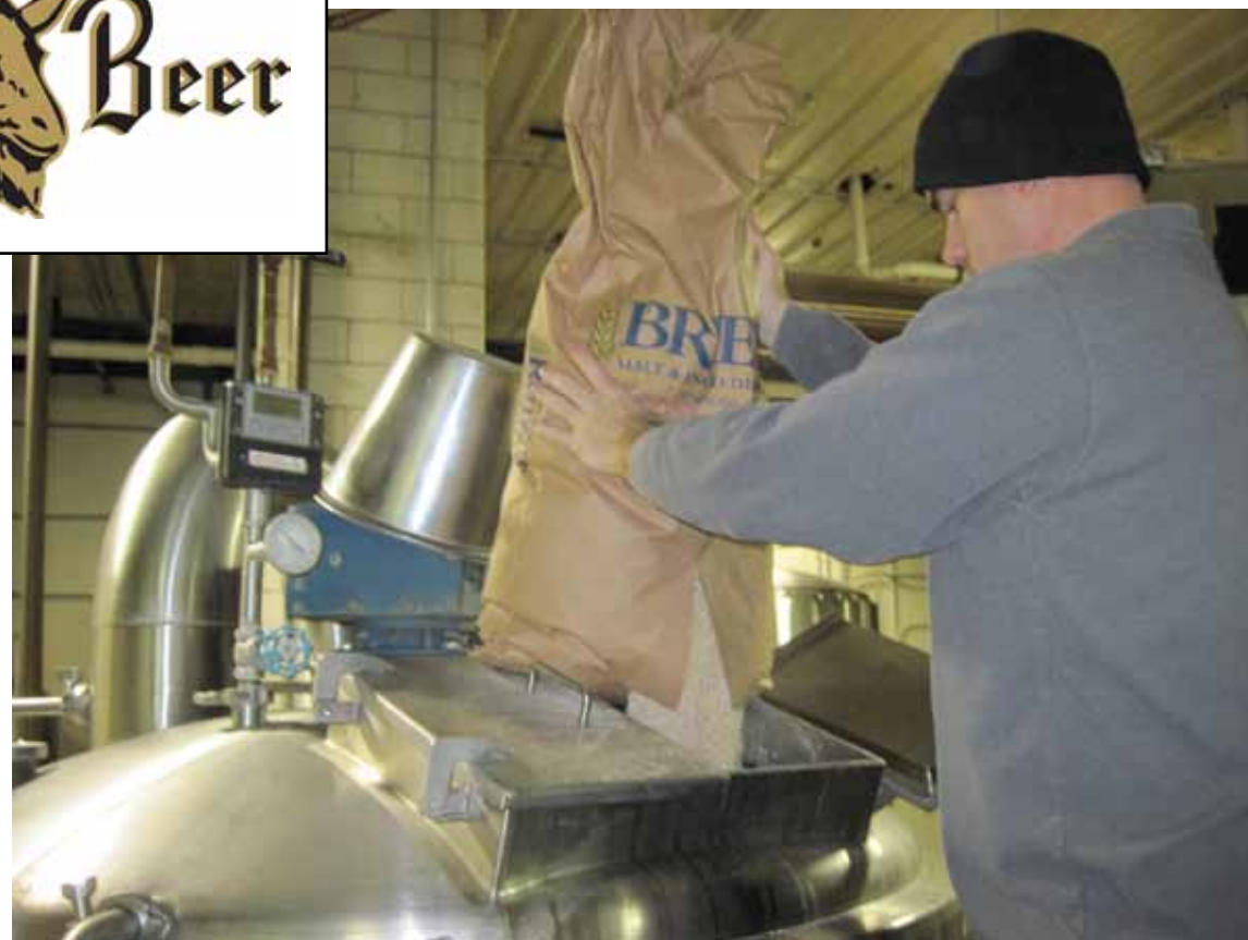
Manually pouring 1015 lbs of grain into the mash tun