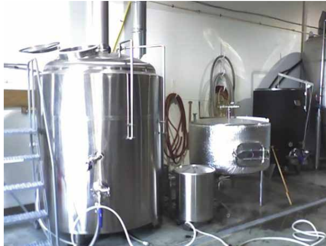
(L) Overhead shot of the brewer in action